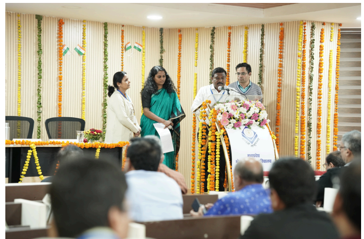
Participants presenting during a group work exercise at the workshop.

based internships and apprenticeships in final year of graduate programmes. The participants highlighted the need for comprehensive faculty training, modular and outcome-based course designing, and leveraging alumni networks for mentorship. The workshop advocated replicating successful vocational models, and aligning curricula with India's NEP 2020. Emphasis was placed on training students in accessing government schemes, and promoting indigenous industries. The workshop underscored collaborative, student-centred approaches to enhance employability across diverse learner profiles in open universities.