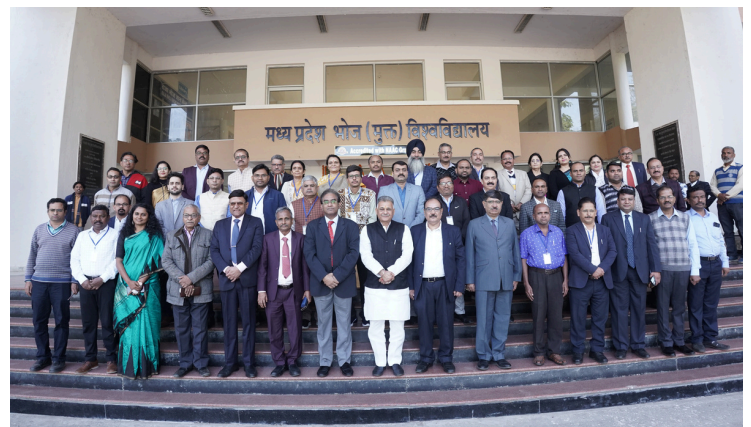
Dignitaries and participants posing for a group picture with Shri Inder Singh Parmar, Honourable Minister of Higher Education and Technical Education, Government of Madhya Pradesh.

open universities (OUs) in India – reaffirming a collective resolve to produce graduates who are more readily prepared for meaningful employment. Participants from these OUs were oriented on the integration and implementation process for higher education. Shri Inder Singh Parmar, Honourable Minister of Higher Education and Technical Education, State Government of Madhya Pradesh, in his remarks as the Chief Guest on the concluding day of the workshop, commended the project as the need of the hour.