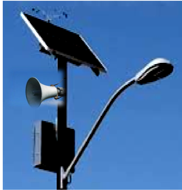
Solar power FM radio with USB - Mobile Charger