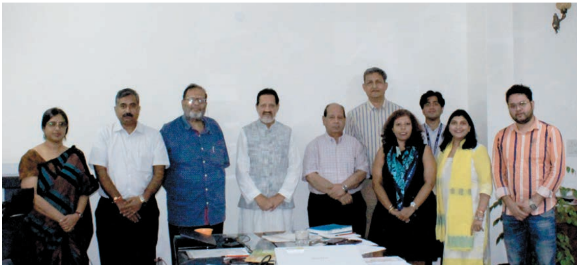
CMC 2023 Jury members