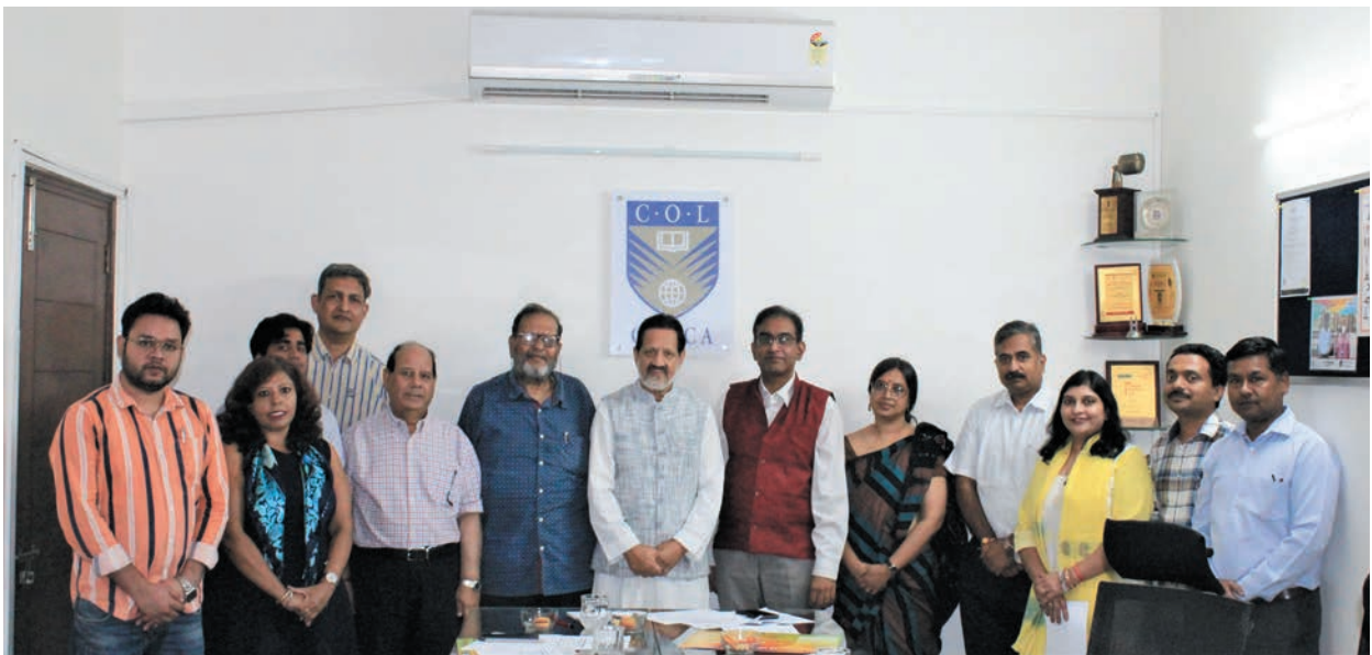
CMC 2023 Jury members and CEMCA staff

This video shows Radio Sugar, a community radio raising awareness about increase in accidents of bulls carrying sugarcane during the harvesting season. The programme was heard by the students of Rajarambapu Institute of Technology and they came up with the idea of attaching a wheel to the cart for support, hence solving the problem cost-effectively. Here we see how community radios can raise awareness about local issues which can result in solving them.