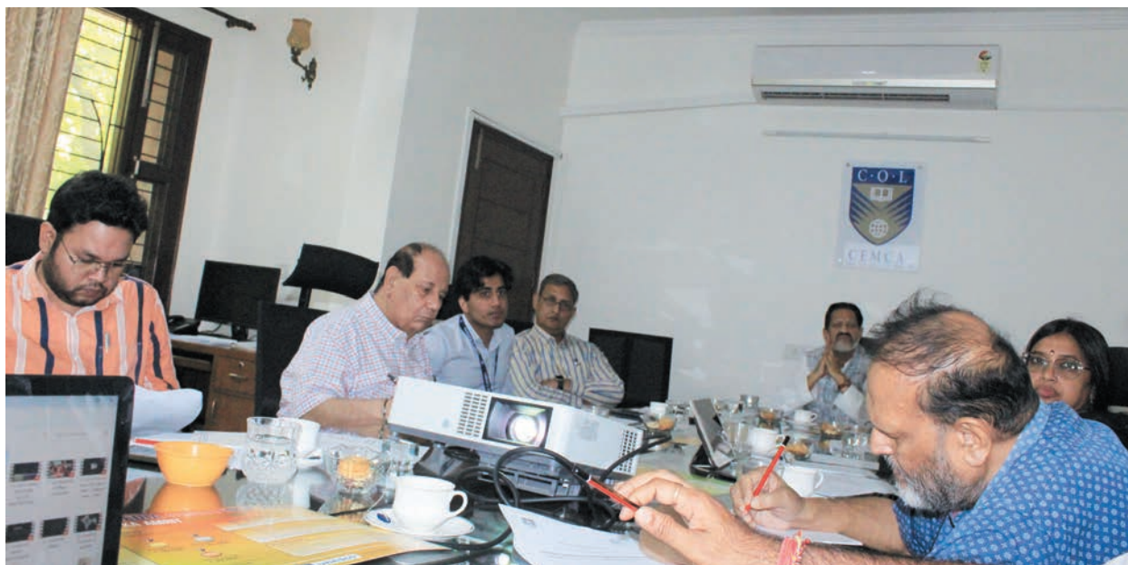
CMC 2023 Jury members reviewing the short films

A one-day workshop will be organised on Production of Audio/Visual content prior to the main award function on first come first serve basis for a maximum of 25 participants.