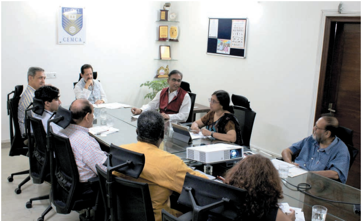
CMC 2023 Jury members discussing the short films submitted by participants

The “Azadi ka Amrit Mahotsav” began 75 weeks before August 15, 2022, i. e., on 12 March 2021, and lasted until August 15, 2023. The initiative’s five pillars—Freedom Struggle, Ideas at 75, Achievements at 75, Actions at 75, and resolves at 75—served as compass points for progress while serving as an inspiration for ambitions and obligations.