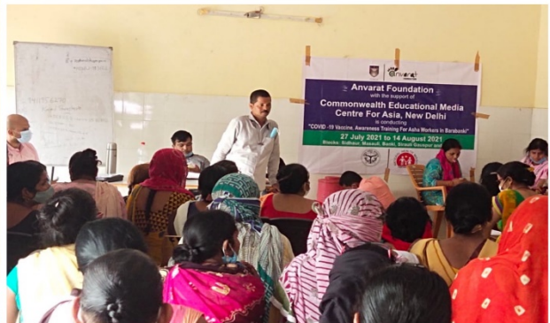
Anvarat Foundation team at Banki block of Barabanki district