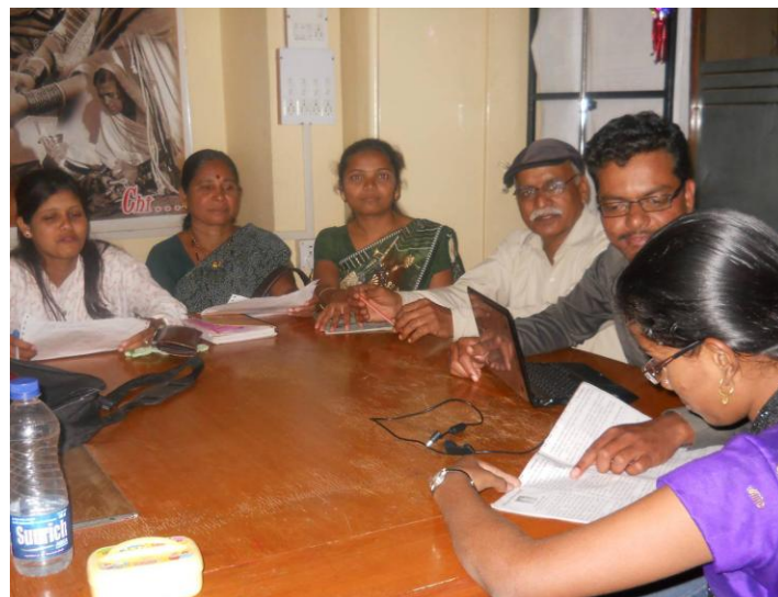
3. Participants working with the Script.