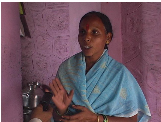
6. Field recording