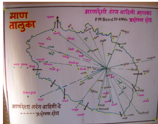
12. Coverage Area of MDTV –CRS