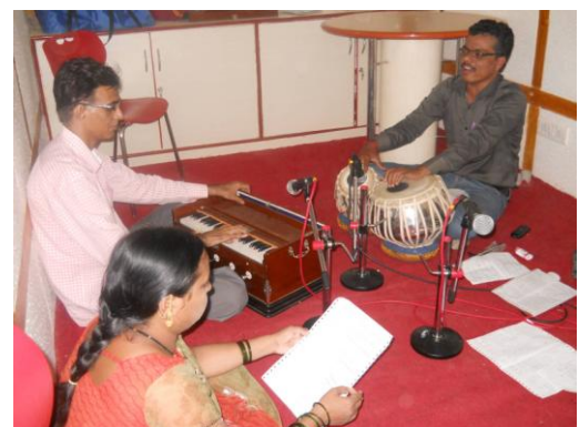
5. Contributing magazine format by Health Songs