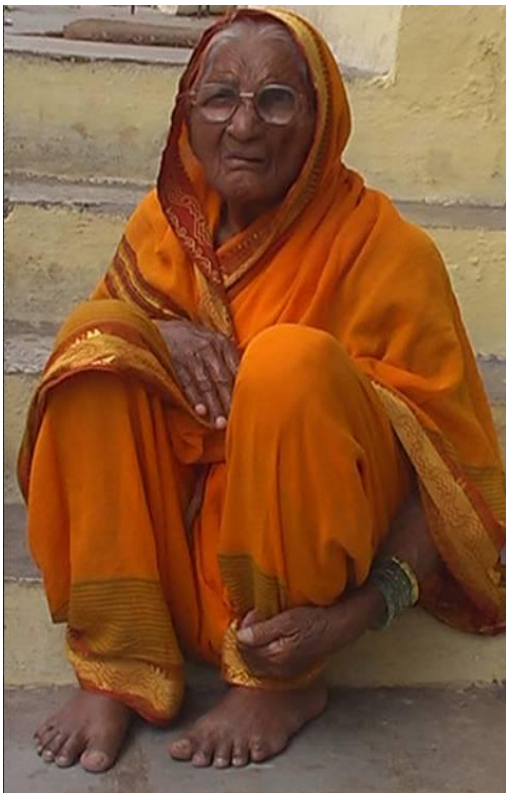
10. A Mann Deshi Lady in traditional attire.

Feedback : The participants were happy as their confidence level was increased. Based upon the feedback of participants, we may say that the understanding & comprehension level was 100 percent as the workshop was conducted in Marathi