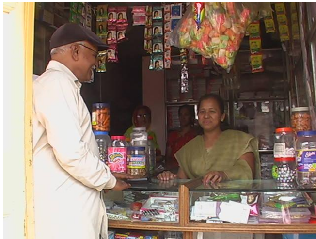
8 Field recording