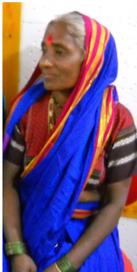
9. A Mann Deshi lady in studio