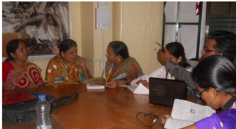
2. Participants at Brain storming

* The participants from 17 to no. 26 were the new entrants who were not participants of the first workshop.