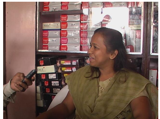
7. Field recording